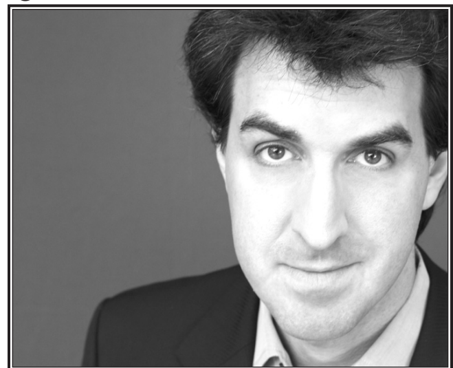
Jason Robert Brown at the Kimmel Center August 4 .

• Oyster House , 1516 Sansom Street in Philadelphia, offers two steamed lobsters, corn on the cob, and drawn butter for $26, a light dinner for two – or hearty feast for one on